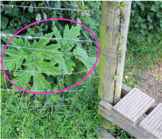
3. By footpath at Park Nook