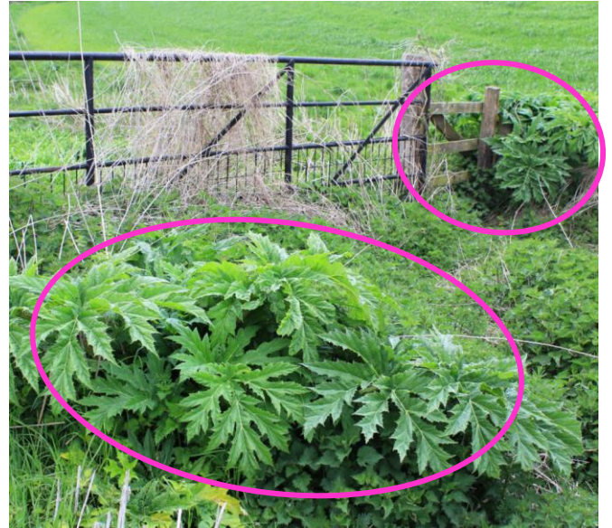
2. Gateway south of Park Nook