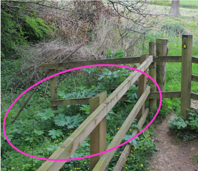
1. Footbridge at Bath Plantation