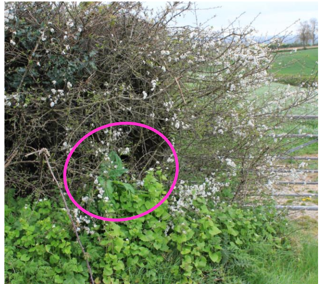
4. Verge on south side of The Common at Park Nook